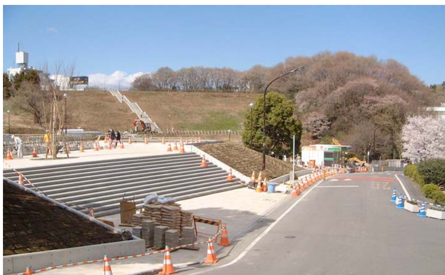
Changing the Campus, Changing the Bioscience and Biotechnology

Box B52, Nagatsuta-cho 4259, Midori-ku Yokohama 226-8501 Japan